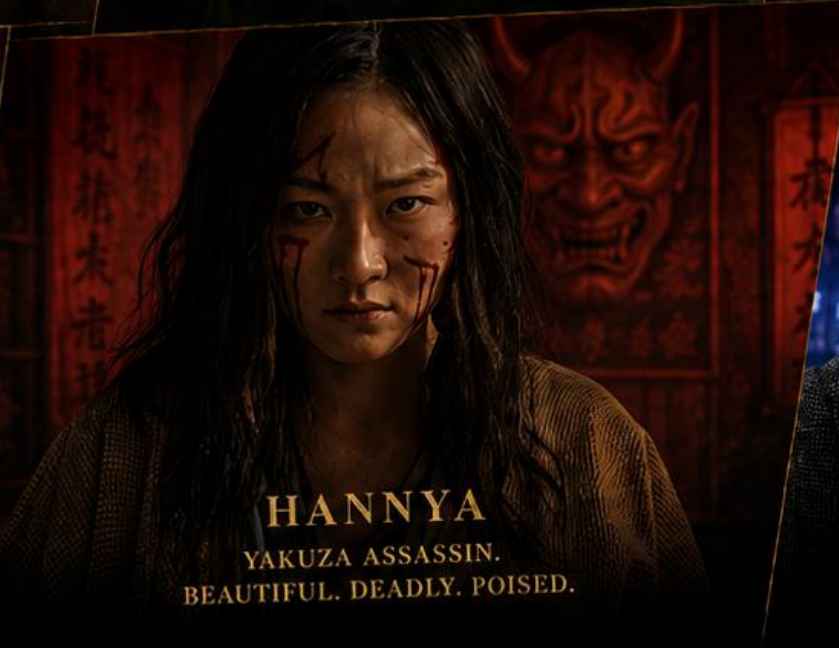
HANNYA YAKUZA ASSASSIN. BEAUTIFUL. DEADLY. POISED.